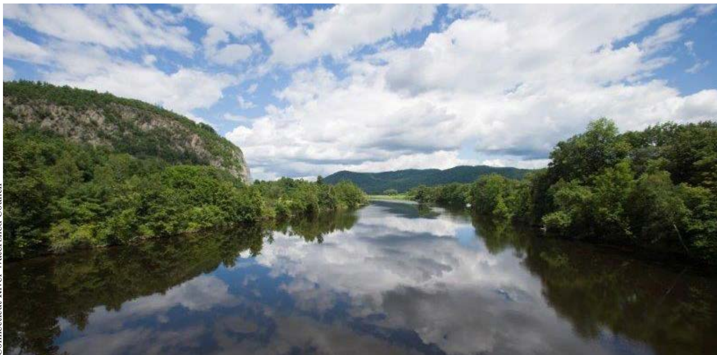
Connecticut River Watershed Council

Connect the Connecticut is a unified vision that considers the value of fish and wildlife species and the natural systems they inhabit. In order to address shared goals and objectives for protecting species and ecosystems, the partners made high quality habitat for a set of 15 fish and wildlife species — including American woodcock, black bear, and Eastern brook trout — a key component of the network of core areas. The partnership identified these species to represent others that rely on similar habitats within the major types of natural systems in the watershed — from spruce-fir forests to small streams to freshwater marshes. Setting specific objectives for each of these species ensures that enough high quality habitat is included in the design, and